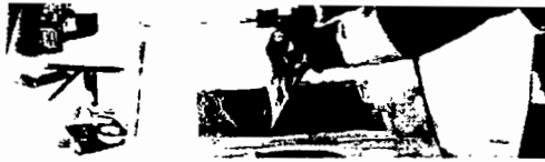
Designing and silkscreening t-shirts is one of the possibilities for a student-run business.

REAL Enterprises, Inc. encourages the creation of school-based community development corporations that serve as a way for schools to educate their youth to stay in their communities and thrive as entrepreneurs. REAL provides curriculum materials and teacher training in entrepreneurship and small business management. REAL Enterprises, 115 Market Street, Suite 320, Durham, North Carolina 27701, (919) 688-7325.